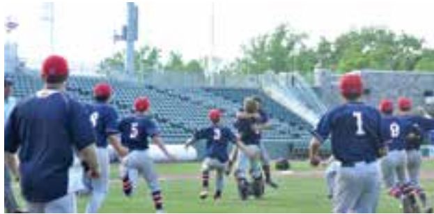
◀ The Bobcats celebrate after winning sectionals.