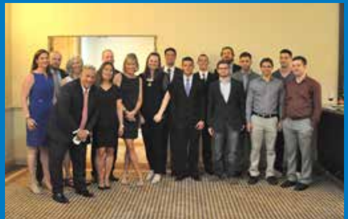
Byram Hills inaugurated its first class of athletes into the district’s new Sports Hall of Fame at a ceremony held on May 28 at Brynwood Country Club in Armonk.