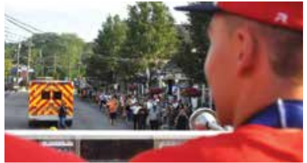
Byram Hills residents cheer the Bobcats during a parade through town. ▶