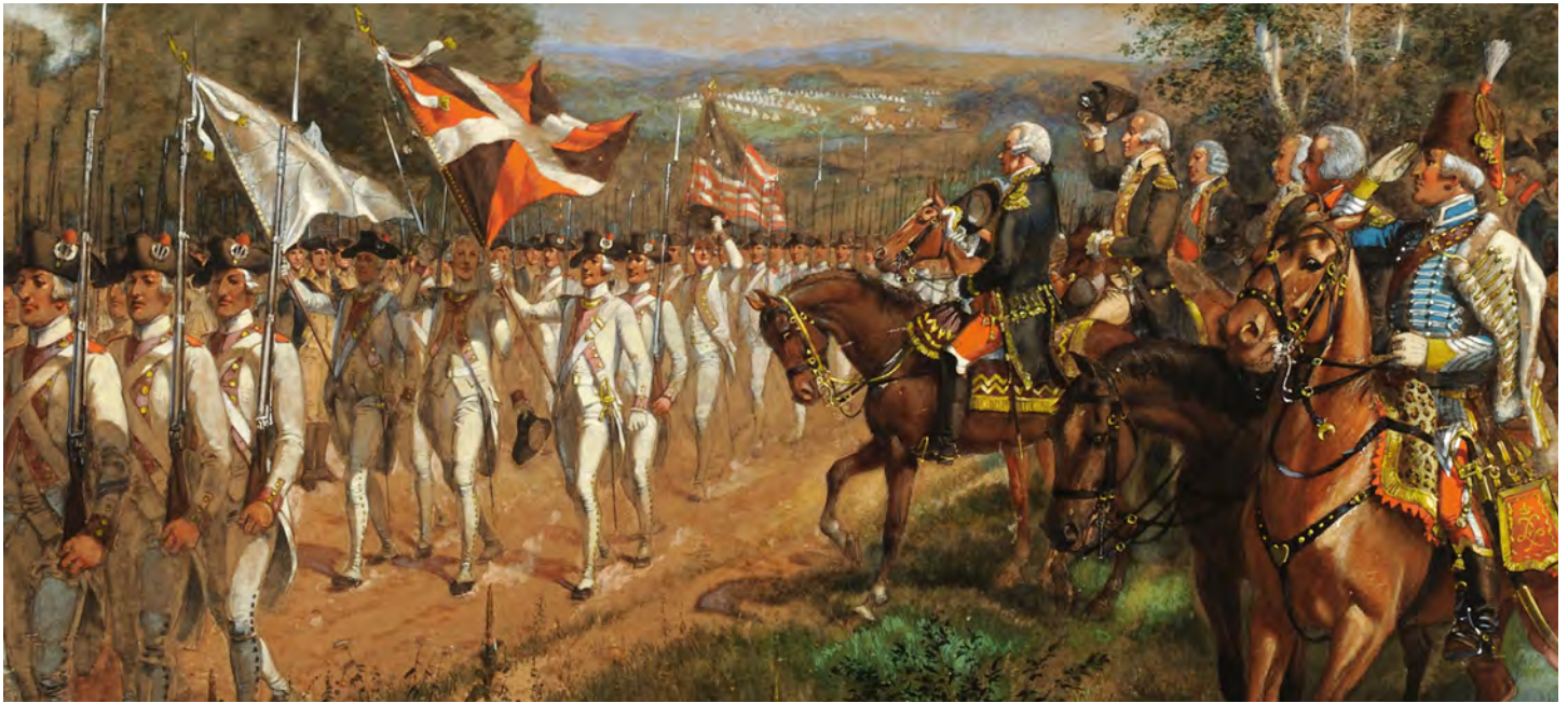
Washington Reviewing Our Ally—the French—1781 by Henry Alexander Ogden. The Society of the Cincinnati, Washington, DC.