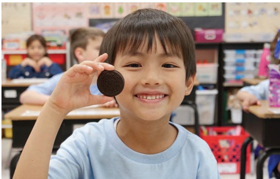
A student with his kindness cookie.

Coman Hill is grateful to the PTSA for providing Coman Hill T-shirts to all staff members, and recess activities including hula hoops, jump ropes and chalk.