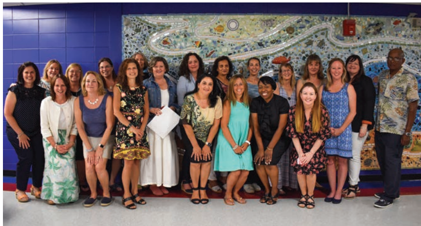
Longevity Service Award recipients who attended the June 14 Board of Education meeting.