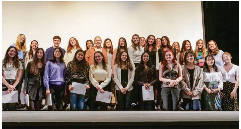
National Art Honor Society 2022 inductees.