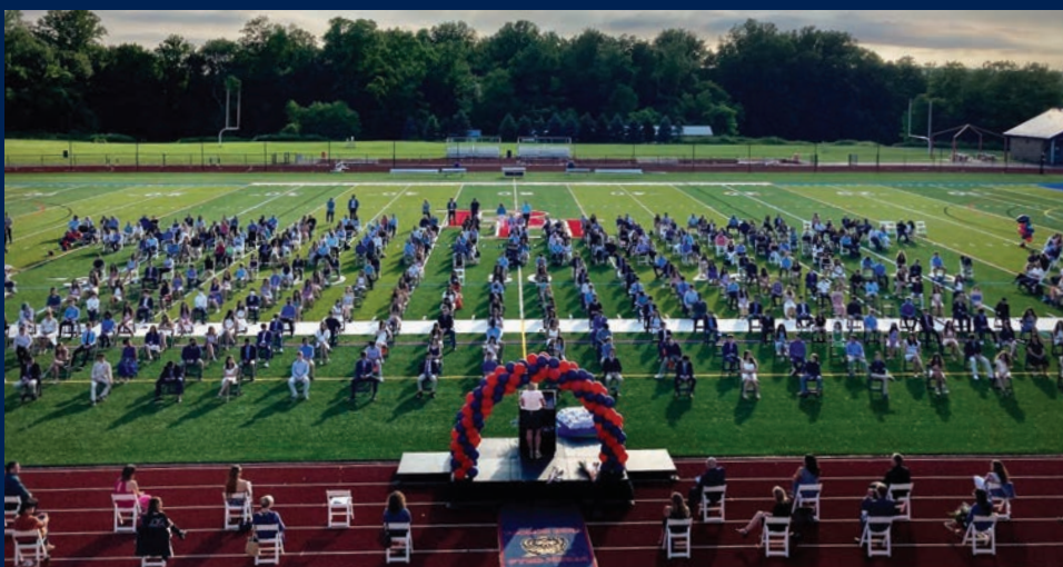
The Grade 8 Moving Up Ceremony on the BHHS turf field.

Students accepted their rolled tee-shirts as each name was read, and lined up on the track to walk a ceremonial lap to finish the event.