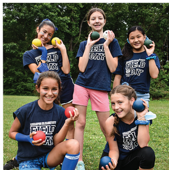
Wampus Elementary students enjoying Field Day.

periods to delve deeper into content. There will be similar blocks of class time at the high school with their new schedule, and an extended lunch period for the entire building.